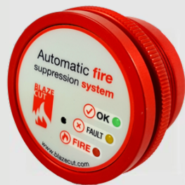
Dash Mounted Alarm Panel (50mm)

The BlazeCut Bus Fire Warning can be used as a first step safety solution to warn the driver and passengers of a fire. As a warning only system, it uses our compact CAP200 50mm Alarm Panel with BlazeWire Linear Heat Detection To monitor the engine bay and electrical areas for fires Or any faults where the temperature may rise above the acceptable levels.